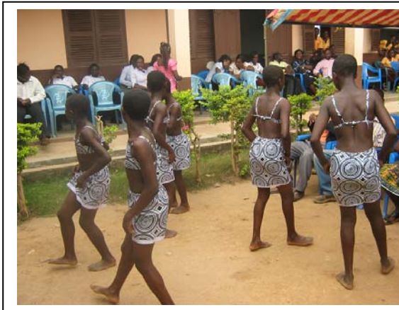
School children dance to traditional music during a GBAF donation ceremony at PIASE in Feb. 2012