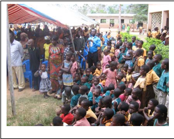
Piase community gathers to hear speeches by GBAF representatives and community leaders during a donation ceremony in February 2012

At Piase, the entire community showed up at the school compound on the day of the donation to see the donated items and hear speeches from GBAF representatives and school officials about the importance of education in the future of the children.